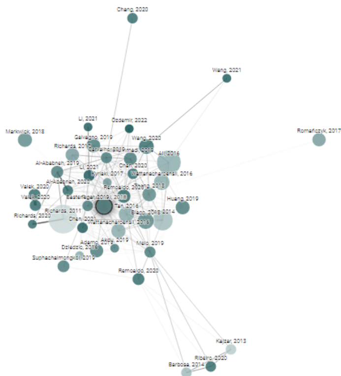
Figure 1: Network of papers